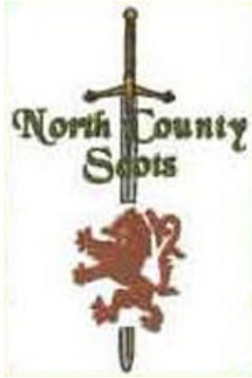
North County Scots